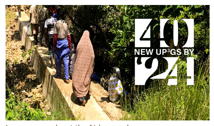
Learn more about the Ndengereko:

Through their continued prayers and working together, this group of African leaders has already engaged with four of these groups. Let's believe God with them!