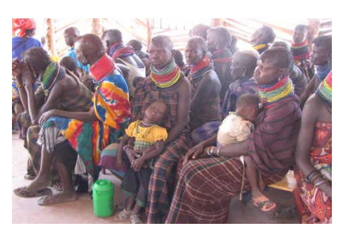
Read more about the GT Turkana Team: https://f.hubspotusercontent40.net/hubfs/ 8927796/PDFs/June2021IntUptWeb.pdf

Using the results from an initial scouting trip, GT's Turkana Team in Kenya will send an advance team in March to begin engaging the Turkana of Ethiopia. While the Kenyan and Ethiopian Turkana share a common language and many traditions, the communities on each side of the border differ greatly. The team of three men will pay attention to these